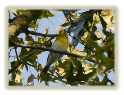
Yellow-throated Vireo (C.P.)