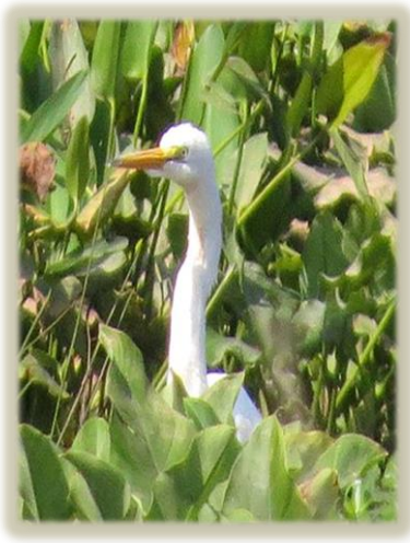
Great Egret (D.F.)